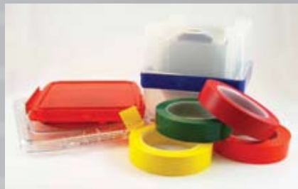
Wafer Box Sealing Tapes