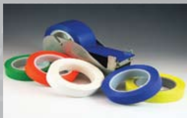
General Purpose Tapes